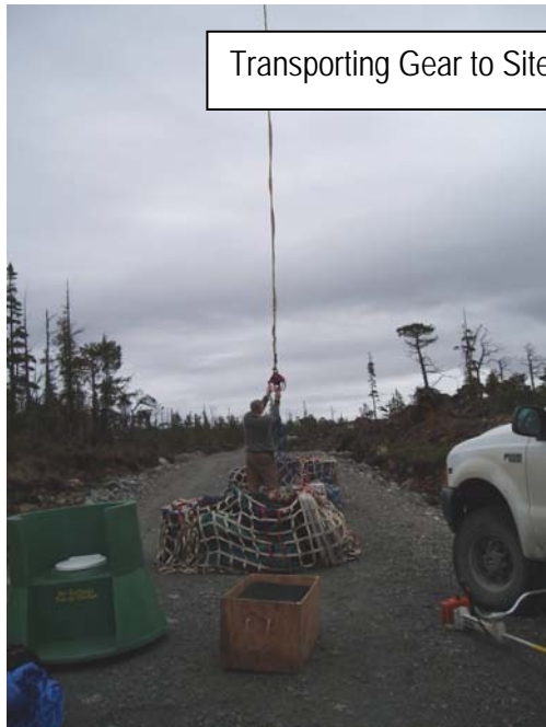
Transporting Gear to Site by Helicopter