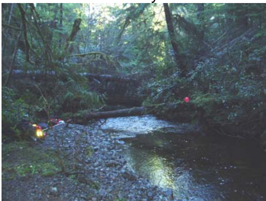
Tributary of Dakota Creek (bridge)