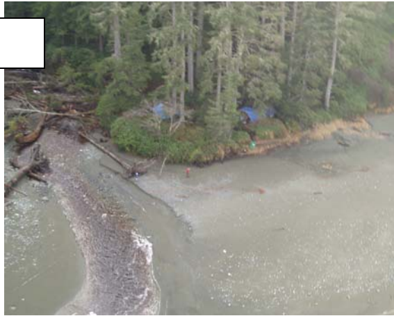
Camp Location In Hemlock & Spruce Forest