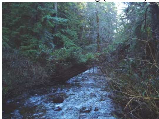
Dakota Creek Crossing (bridge)