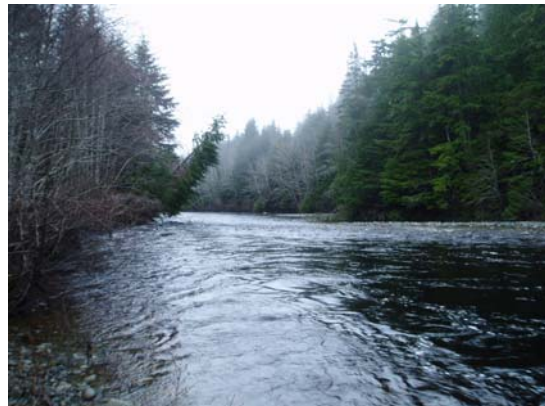
Nahwitti River crossing