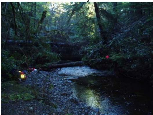
Tributary of Dakota Creek