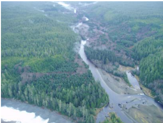
Nahwitti River estuary